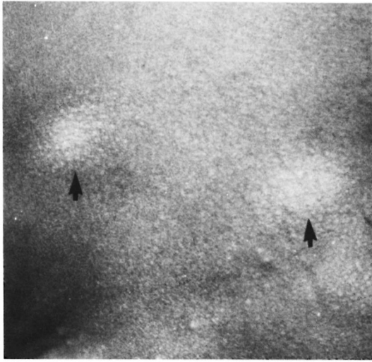
FIG. 1. Back of case 1, showing two lesions.