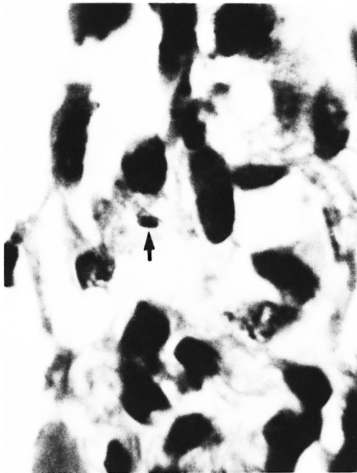
FIG. 2. Histological section showing nerve affection and bacilli (▲) (Fite-Faraco \times 1000 ).

ported earlier ( 4 ), undoubtedly had leprosy as confirmed histologically. In both instances, a skin biopsy showed indeterminate disease with nerve infiltration as well as AFB in the nerves. Additionally, in the second case, even though the infant was only